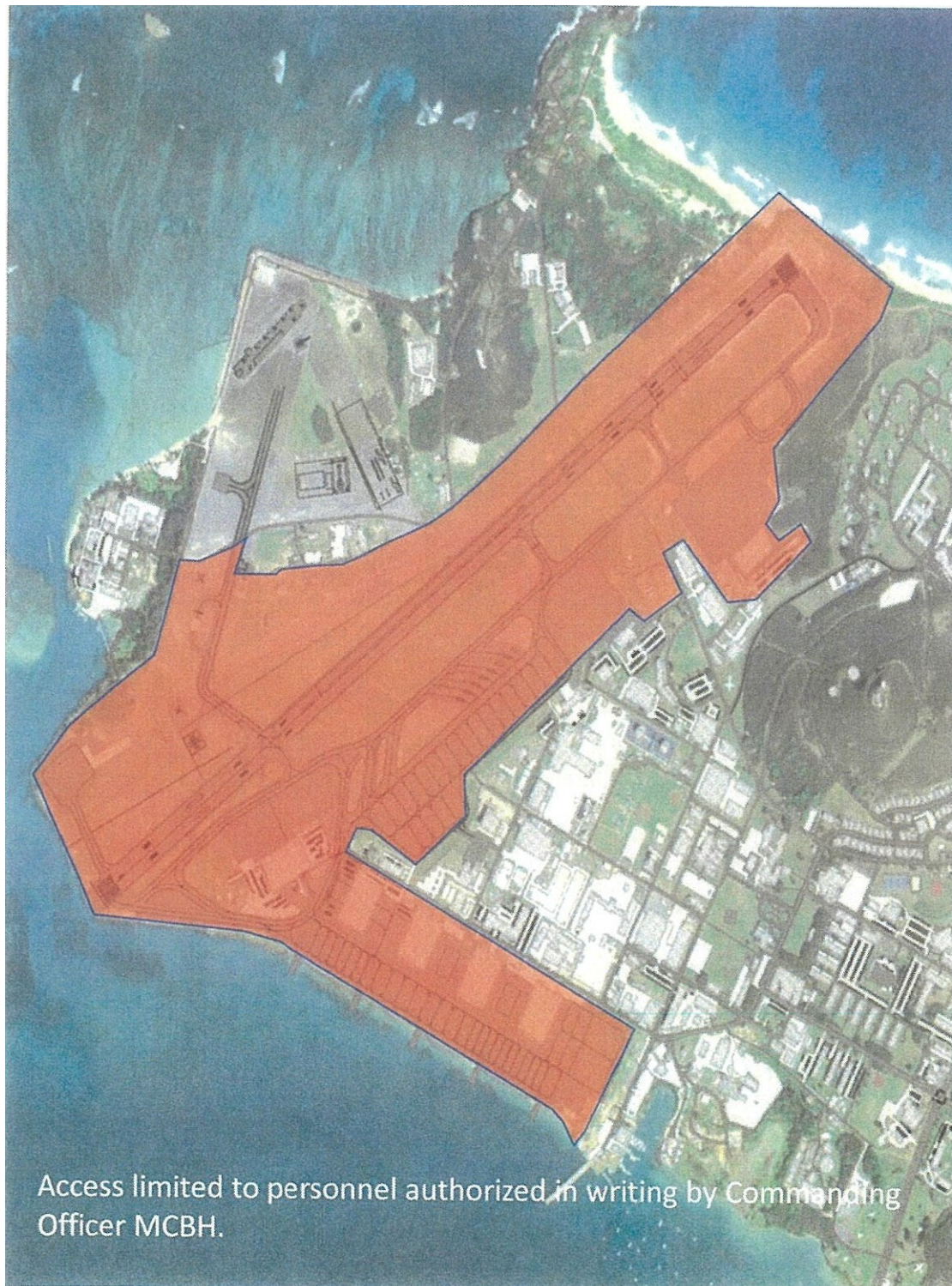
Figure 3-1 MCAS Restricted Areas