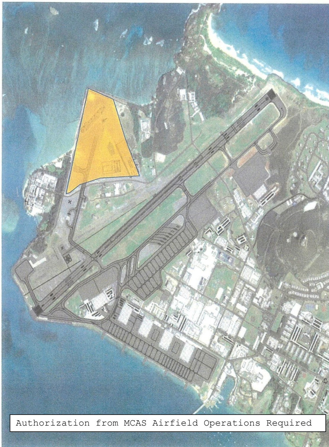
Figure 3-3 MCAS Westfield Area